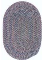
TI50 Federal Blue