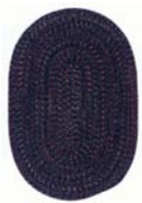
WA53 Blue Mix