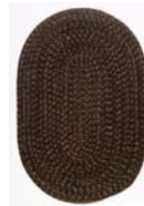
WA83 Brown Mix