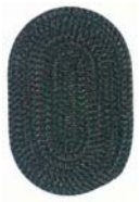
WA63 Alpine Mix