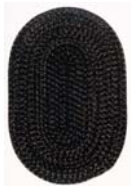
WA43 Black Mix

visit www.colonialmills.com for more info