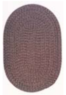
WA93 Plum Mix