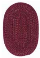
WA73 Berry Mix