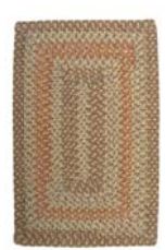
VL24 Walnut Birch