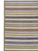
SE80 Beach Front