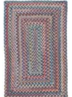
RV20 Floral Burst