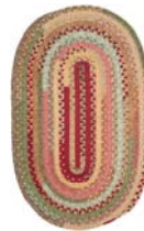
OV69 Light Parsley