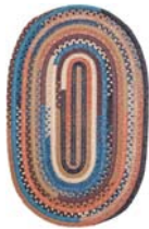
OV49 Soft Black