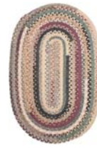
OV79 Cranberry Blend