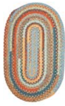
OV59 Vintage Blue