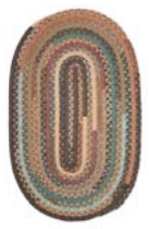
OV89 Warm Chestnut