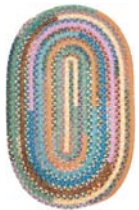
OV19 Dusty Shale

visit www.colonialmills.com for more info