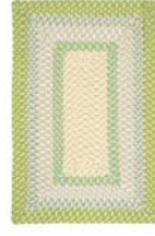
MG69 Lime Twist