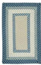
MG59 Blue Burst