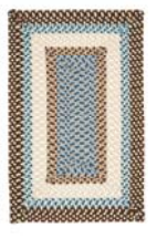
MG89 Bright Brown