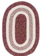
MO96 Deep Wine