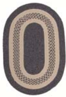
MO57 Drest Blue