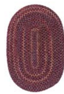
MN86 Burnt Brick