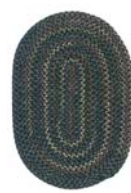
MN66 Deep Forest