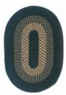
MD64 Alpine Green