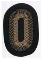
MD44 Jet Black

visit www.colonialmills.com for more info