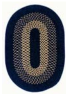
MD54 Blue Moon