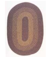
MD94 Dark Plum