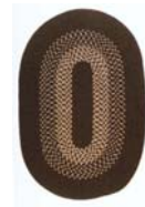
MD84 Roasted Brown