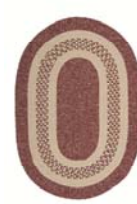
J702 Red Streak