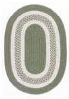
J401 Moss Green