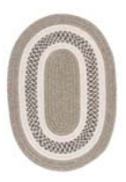
J802 Desert Beige