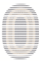
J502 Blue Ribbon