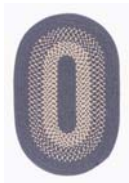
JK50 Federal Blue