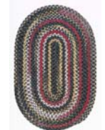
CK97 Saddle Brown