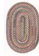
CK87 Straw Beige