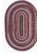
CK77 Amber Red