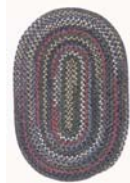
CK57 Baltic Blue