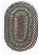
CK67 Thyme Green