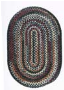
CK47 Black Satin

visit www.colonialmills.com for more info