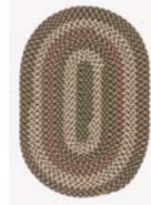
BF72 Natural Earth