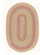
BF82 Tea Stained