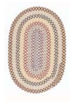
BC82 Harbour Lites