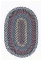
BC62 Public Garden