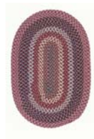
BC72 Brick Marketplace