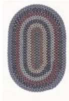
BC52 Winter Blues