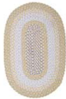
BK39 Daisy Dreams