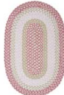
BK79 Tea Party Pink