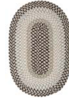
BK89 Chocolate Mint Chip