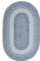
BK59 Blueberry Pie