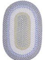
BK99 Lilac Loves