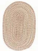
AM30 Evergold Mix